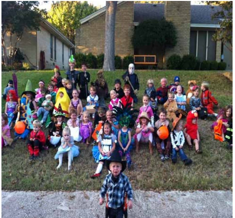
Goblins and ghosts galore gathered for the Women's Social Club Halloween Pre Trick or Treat party, which was a huge success!